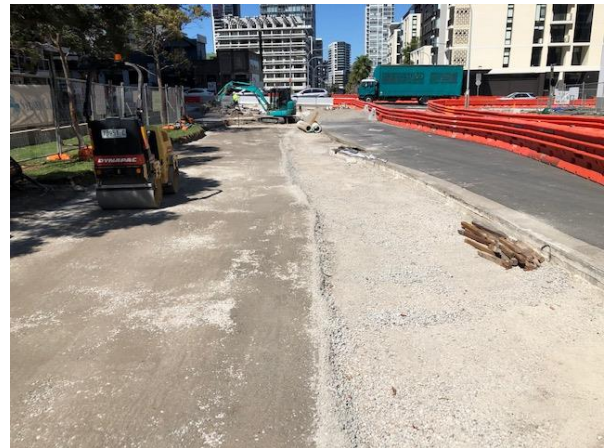
Photo above – Section of demolished and prepared areas for cycle way and road on Gadigal Avenue