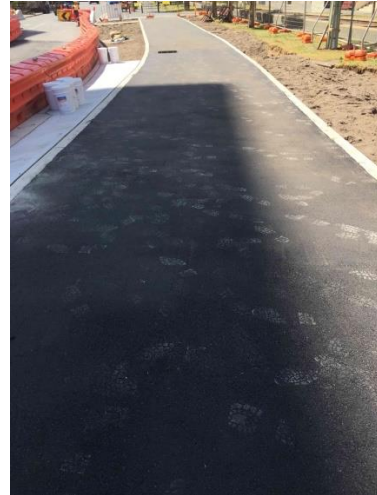
Photo above – Completed cycleway section. North-East corner along Gadigal Avenue

For more information on the project, please go to Council's web page: