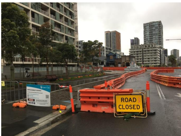
Northern side works completed

https://community.sydneycivil.com/intersection-of-lachlan-street-and-gadigal-avenue-zetland