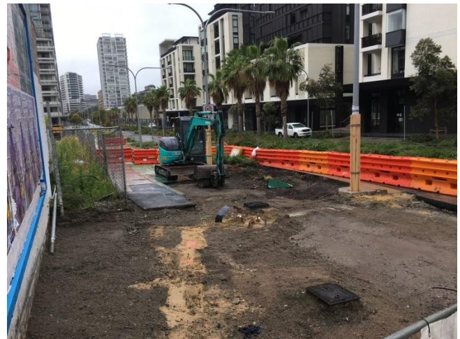
Southern side works under way

For more information on the project, please go to Council's web page: